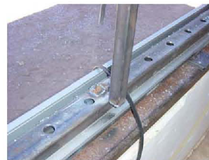
Figure 6. Failure of Standard Muntim End Connection.

Muntin Window Systems – Blast-resistant muntin window systems consist of a heavy laminated glass pane (similar to a car windshield) backed by a structural tube system, which is welded to an outer steel frame. This is a fairly new type of blast mitigation window system that was designed for the Federal Government and has been implemented in a number of buildings. Recent explosive tests exposed a weakness in the end connections of the structural tubes with the occurrence of a brittle fracture failure (Figure 6). This failure was unexpected, as the system was designed using standard methods to withstand this level of loading. New methods of attachment for these end connections have been proposed.