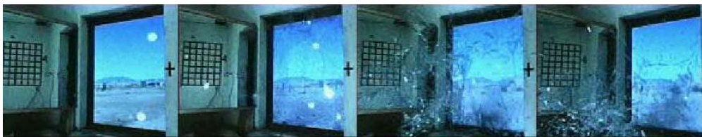
Figure 4. Video Footage of Window Test.

To supplement the measured data, the response of each test window is fully documented using high-speed video as well as digital still photography. Figure 4 shows the progression of window failure as captured through high-speed video during an explosive test.