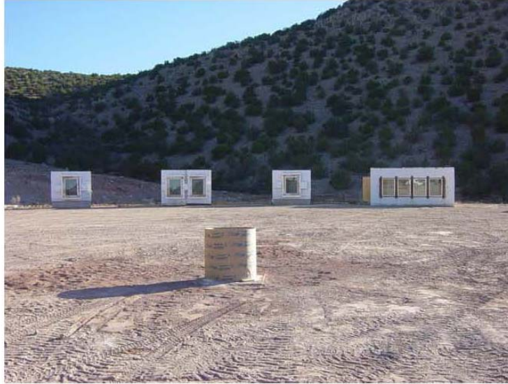
Figure 3. Marked Location for Explosive Charge.