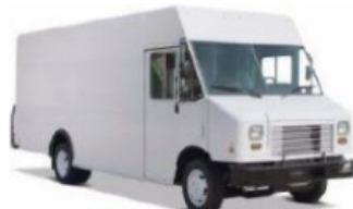
Class 6 Delivery Van Global Enterprise/MOTIV 105 mile range $407,447 GSA MAS