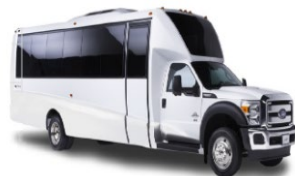
Class 6 35-40 pax Bus Global/ MOTIV Power Systems 105 mile range $475,355 GSA MAS