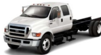
Class 4/6 Box Truck Global Enterprise/MOTIV 105 mile range $325-$393,866 GSA MAS