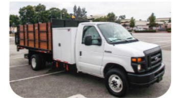
Class 8 Stake Bed Truck Global Enterprise/MOTIV 105 mile range $676,468 GSA MAS