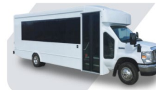
12-16 pax Bus TESCO/Turtle Top Terra/MOTIV 105 mile range $214,955-$221,988 AutoChoice