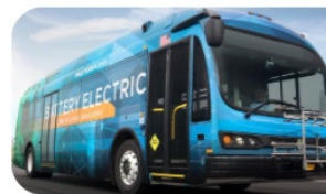
35-40 Ft Catalyst E2 Proterra 250+ mile range $660,574-$771,869 GSA MAS