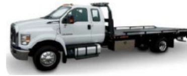
Class 4/6 Stake Bed Truck Global Enterprise/MOTIV 105 mile range $305-$373,498 GSA MAS