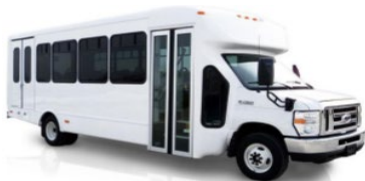
ZEUS 305 SHUTTLE BUS Phoenix Motor Cars LLC 100 mile range $263,733 GSA MAS