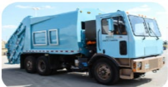
Class 8 Trash Truck Global Enterprise/MOTIV 105 mile range $937,128 GSA MAS