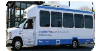
Electric Prisoner Transport Bus Global/Capitol/Coachworks/MOTIV 105 mile range $352-$363,637 GSA MAS