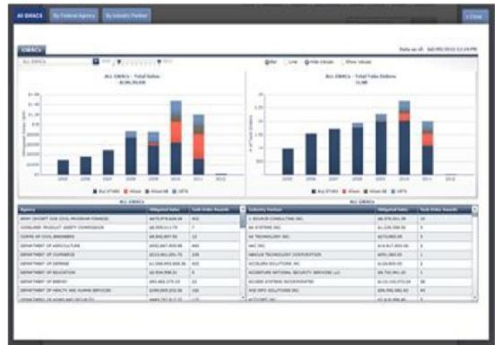
GSA's GWAC Dashboard

As the federal government's lead procurement organization, GSA employees are required to use existing GSA acquisition vehicles before establishing new contracts for similar products or services. Contract vehicles include the Federal Strategic Sourcing Initiative (FSSI), the Multiple Award Schedules (MAS), Governmentwide Acquisition Contracts (GWACs) and other multiple agency solutions.