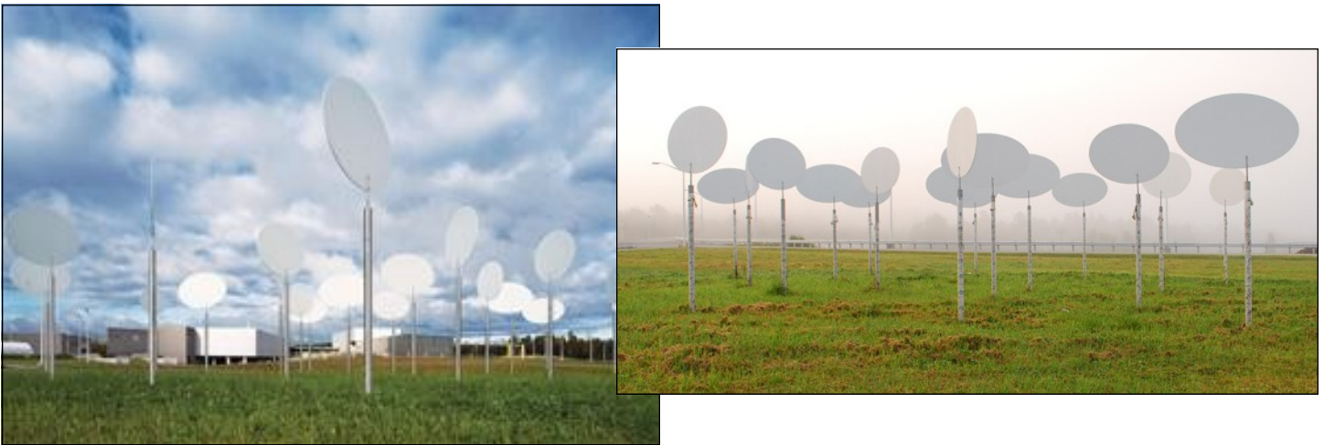
“The Impossibility of White” by Spencer Finch, 2009

The GSA Art in Architecture Program commissions the nation's leading artists to create large-scale works of art for new federal buildings.