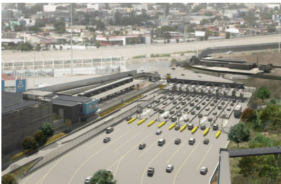
Rendering depicting southwest view of the expanded lanes