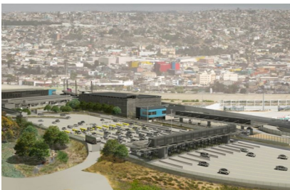
Rendering depicting southeast view of the expanded lanes and new employee parking structure