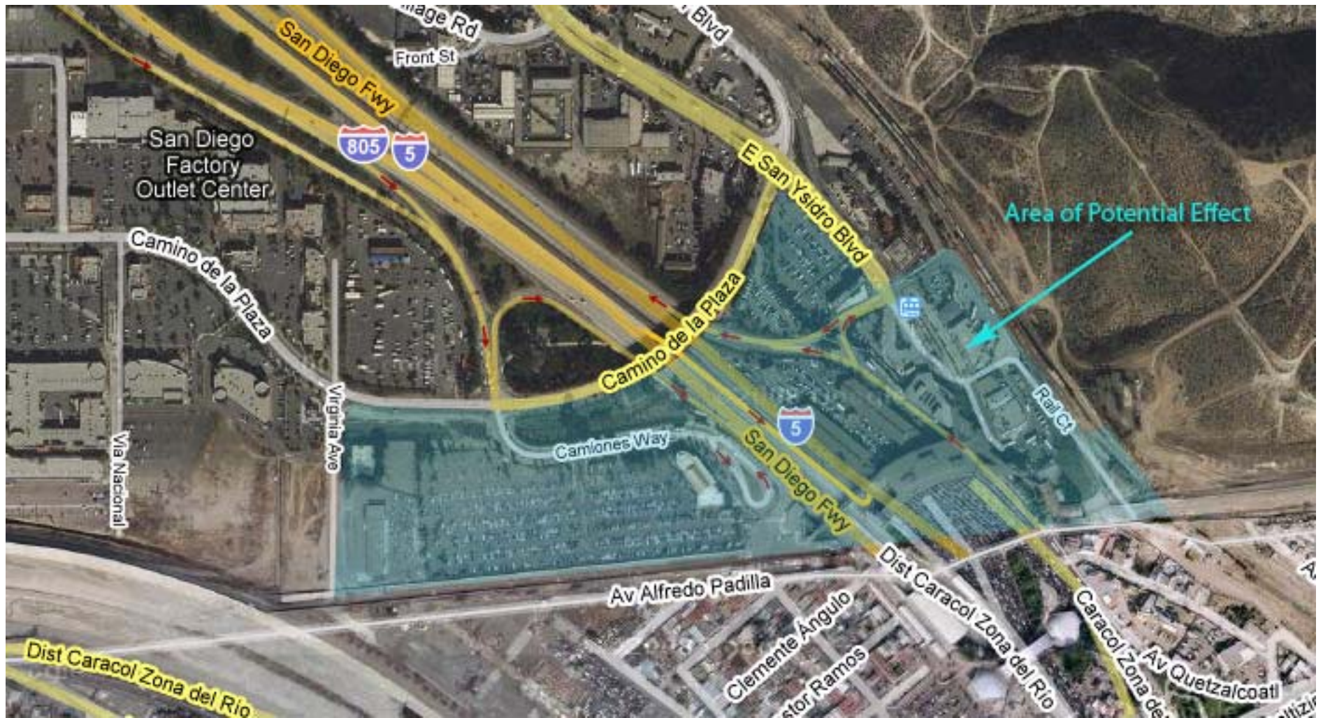
Figure 4 – Area of Potential Effect, aerial view