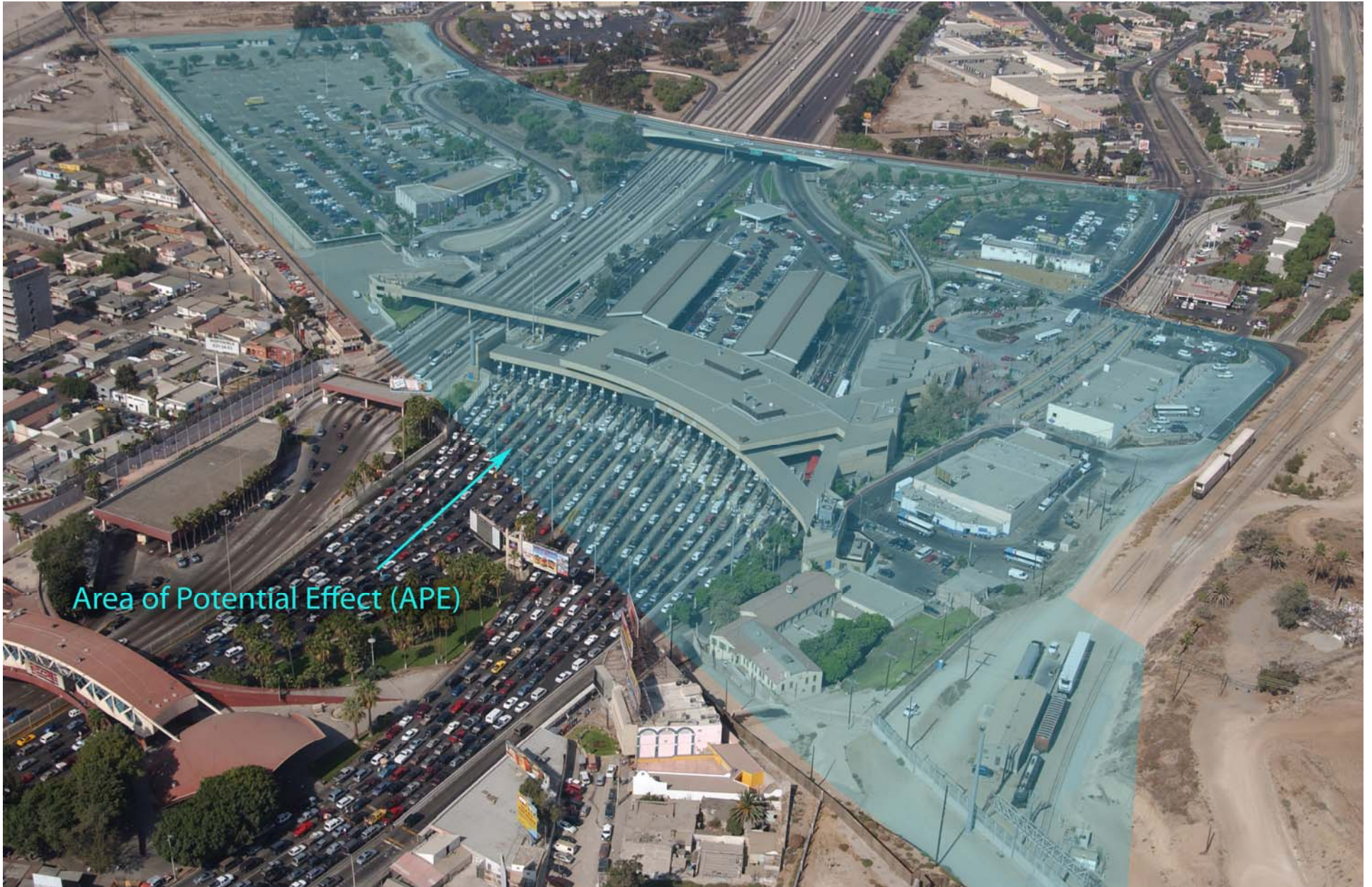
Figure 5 – Area of Potential Effect, oblique view