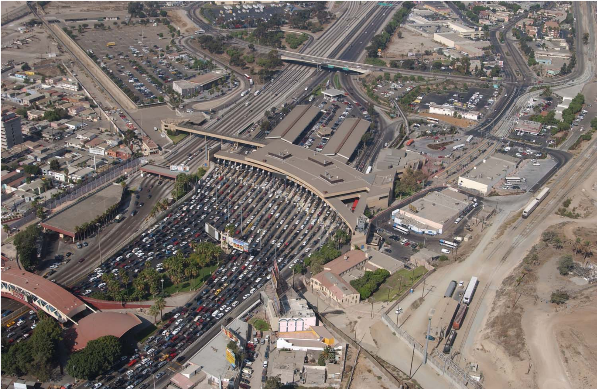
Figure 2 – Existing San Ysidro Port of Entry, c. 2000