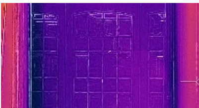
Outside temperature 27° Single-pane interior glass 42°

Single- & double-pane configurations 2 to 3 times lighter than inserts manufactured with standard glass