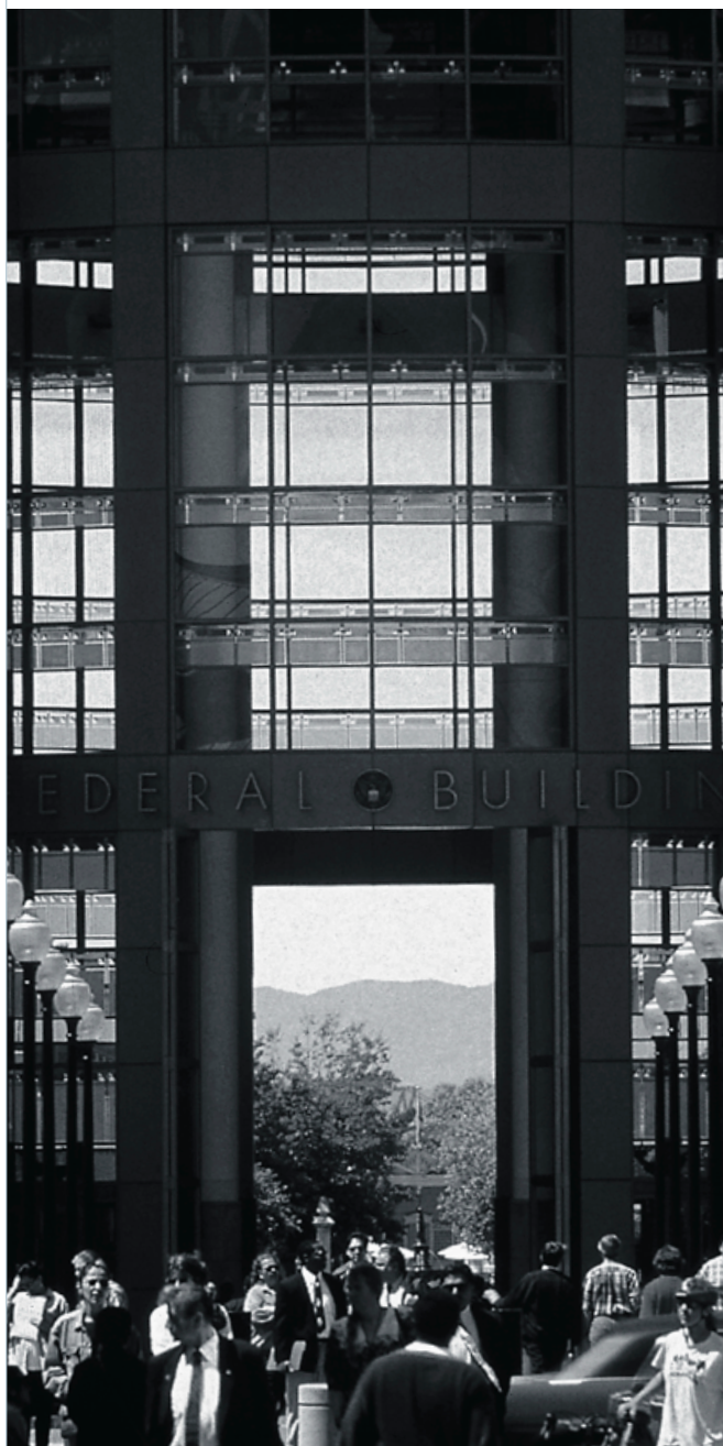
Oakland Federal Building, Oakland, CA

Pedestrian Circulation. The project team should consider neighboring uses, existing pedestrian patterns, local transit, and the building's orientation to anticipate pedestrian 'desire lines' to and from the building from off site. Designers should avoid dead ends, inconvenient routes, and the like and consider how people moving across the site might help to activate sitting areas, outdoor art, programmed events, etc.