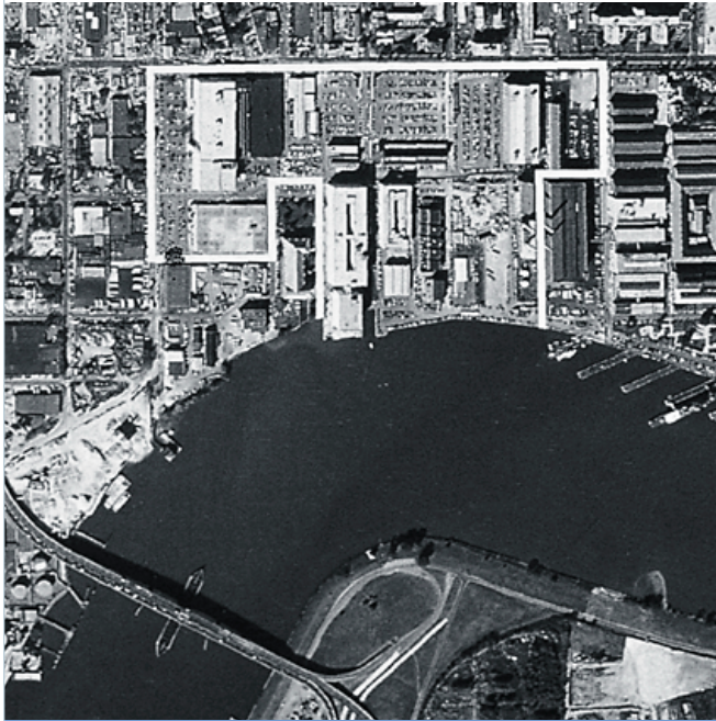
Southeast Federal Center Master Plan, Washington, D.C.

The quality of the site design and its design will be a direct extension and integration of the building design intent. It represents significant Federal investment and should, wherever possible, make a positive contribution to the surrounding urban, suburban or rural landscape in terms of conservation, community design and improvement efforts, local economic development and planning, and environmentally responsible practices.