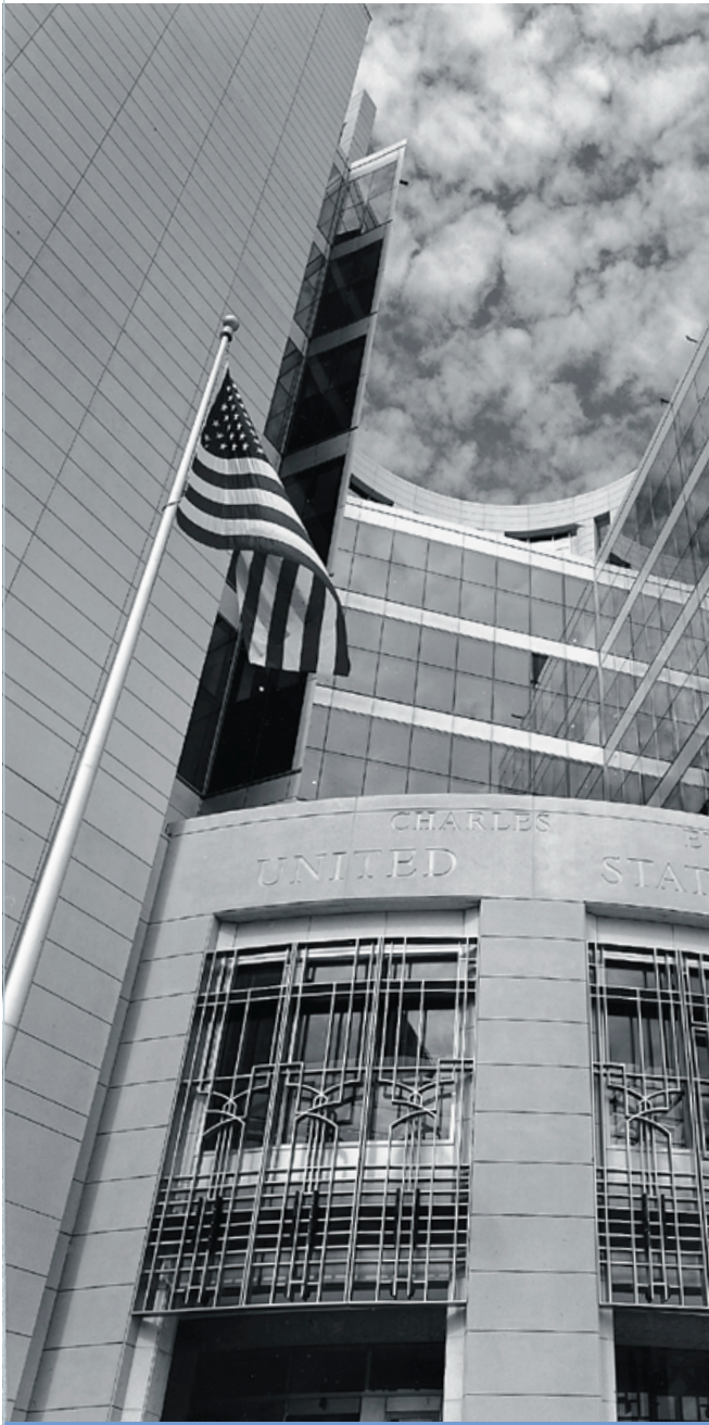
Charles Evans Whittaker United States Courthouse, Kansas City, MO