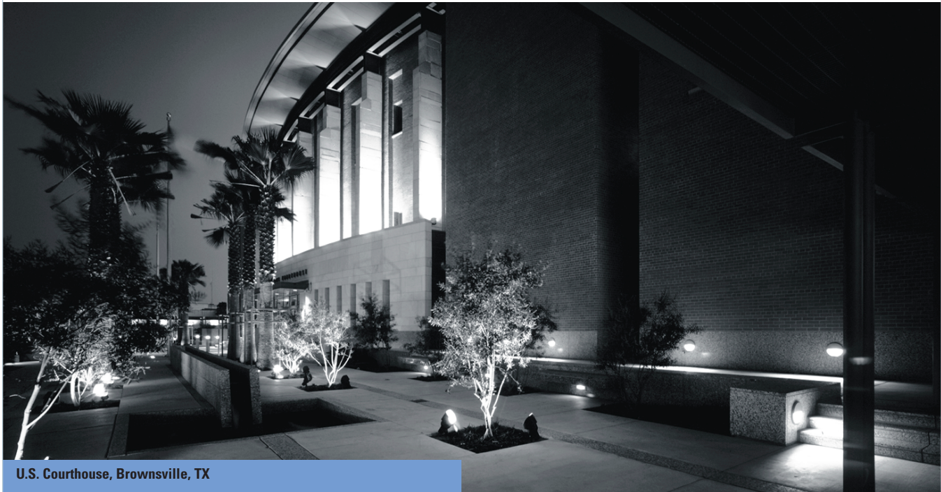
U.S. Courthouse, Brownsville, TX

Landscape lighting should be used to enhance safety and security on the site, to provide adequate lighting for nighttime activities and to highlight special site features. See Chapter 6: Electrical Engineering, Lighting, Exterior Lighting .