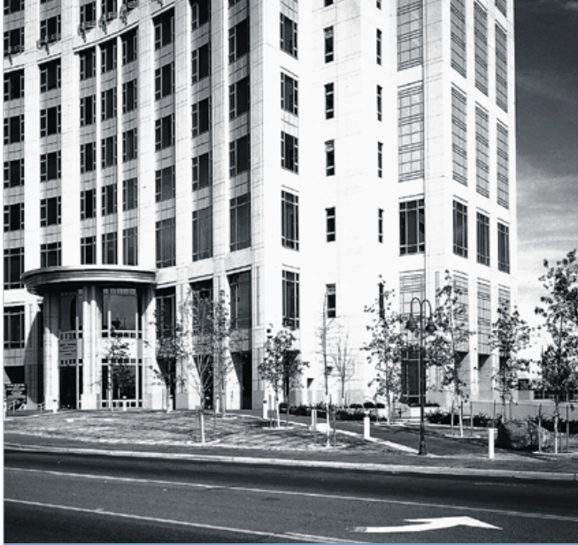
Bruce R. Thompson U.S. Courthouse and Federal Building, Reno, NV

roads capable of accommodating fire department aerial apparatus. Overhead utility and power lines shall not be within the aerial access roadway. In addition, at least one access road having a minimum unobstructed width of 26 feet shall be located within a minimum of 15 feet and a maximum of 30 feet from the building. Also, at least one side of all buildings shall be accessible to fire apparatus.