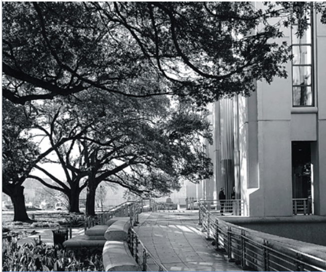
Russell B. Long Federal Building and United States Courthouse

Sustainable design benefits GSA with healthier, longer-lived plantings which rely less on pesticides, herbicides and fertilizers, minimize water use, require less maintenance and increase erosion control.