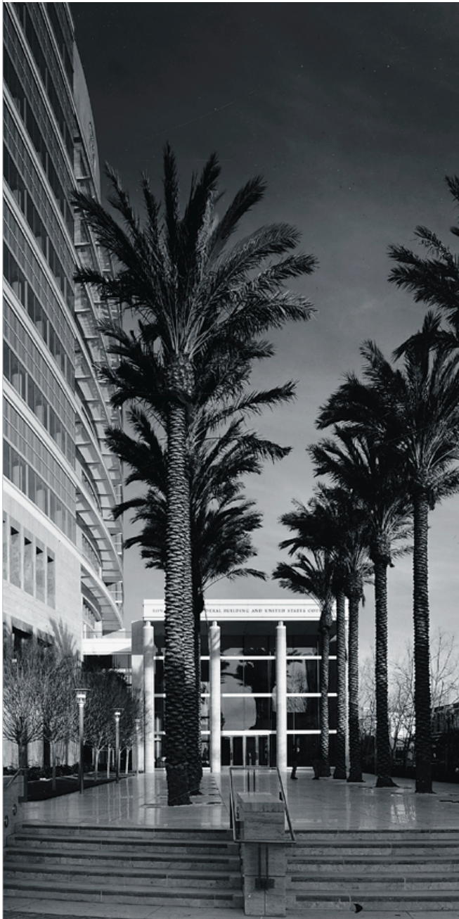
Ronald Reagan Courthouse, Santa Ana, CA