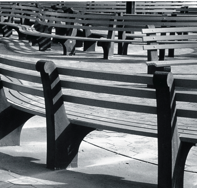
Jacob Javits Plaza, New York, NY

Site furniture shall be compatible in design, size and color with the surrounding architecture and landscape design. They should be selected and submitted in the Design Development package (see Appendix A: Submission Requirements ).