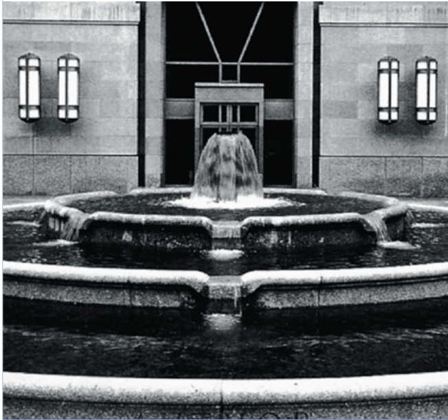
Reagan Building Plaza fountain, Washington, D.C.