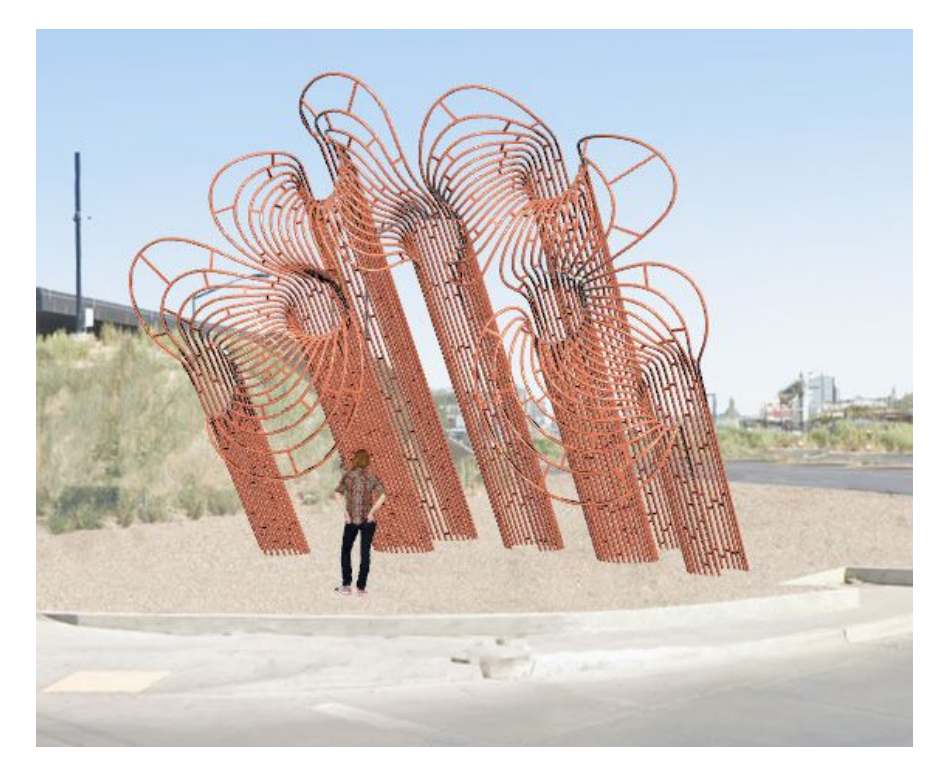
Calexico Land Port of Entry 2A