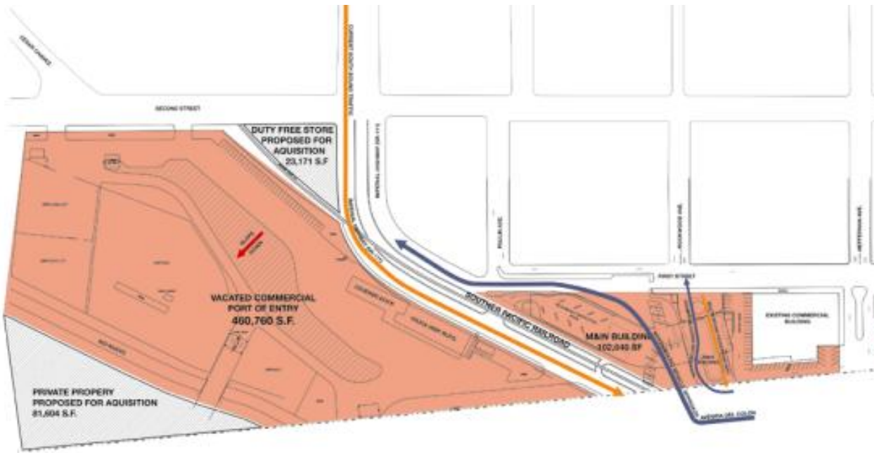
Figure E-2. Current Calexico West POE and Site Boundaries