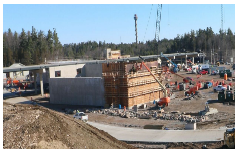
A view looking northeast at the non-intrusive inspection building wall construction.

The weather in this area can be dangerous for drivers. Please drive carefully and pay attention to construction signage and maintenance vehicles.