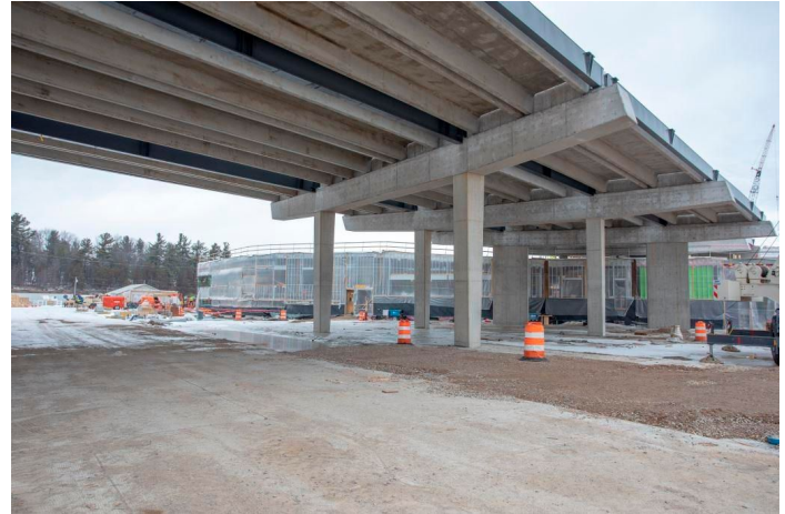
A view looking northeast at the overhead parking structure from ground level.