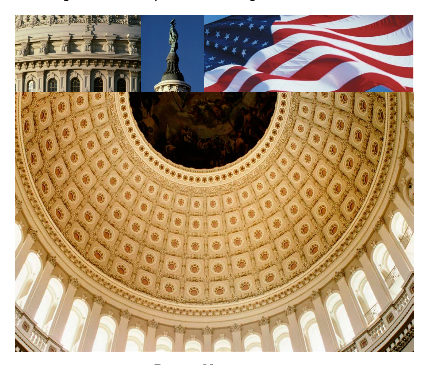
Report No. 45 April 1, 2011 to September 30, 2011