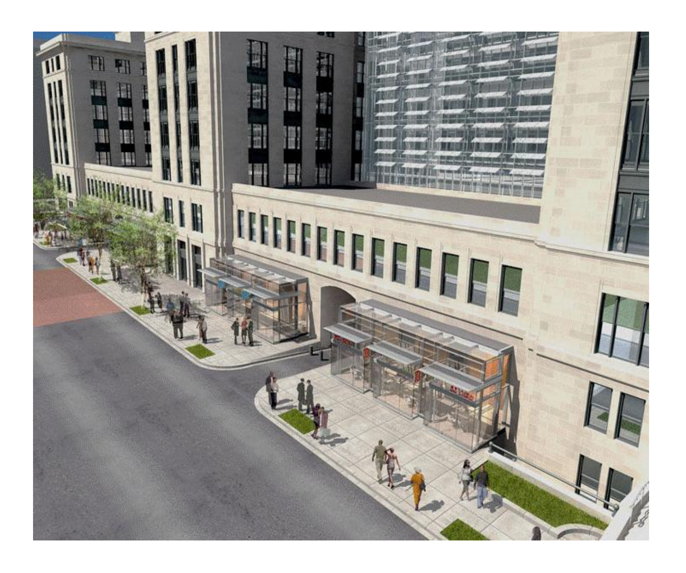
Report No. 49

April 1, 2013 through September 30, 2013