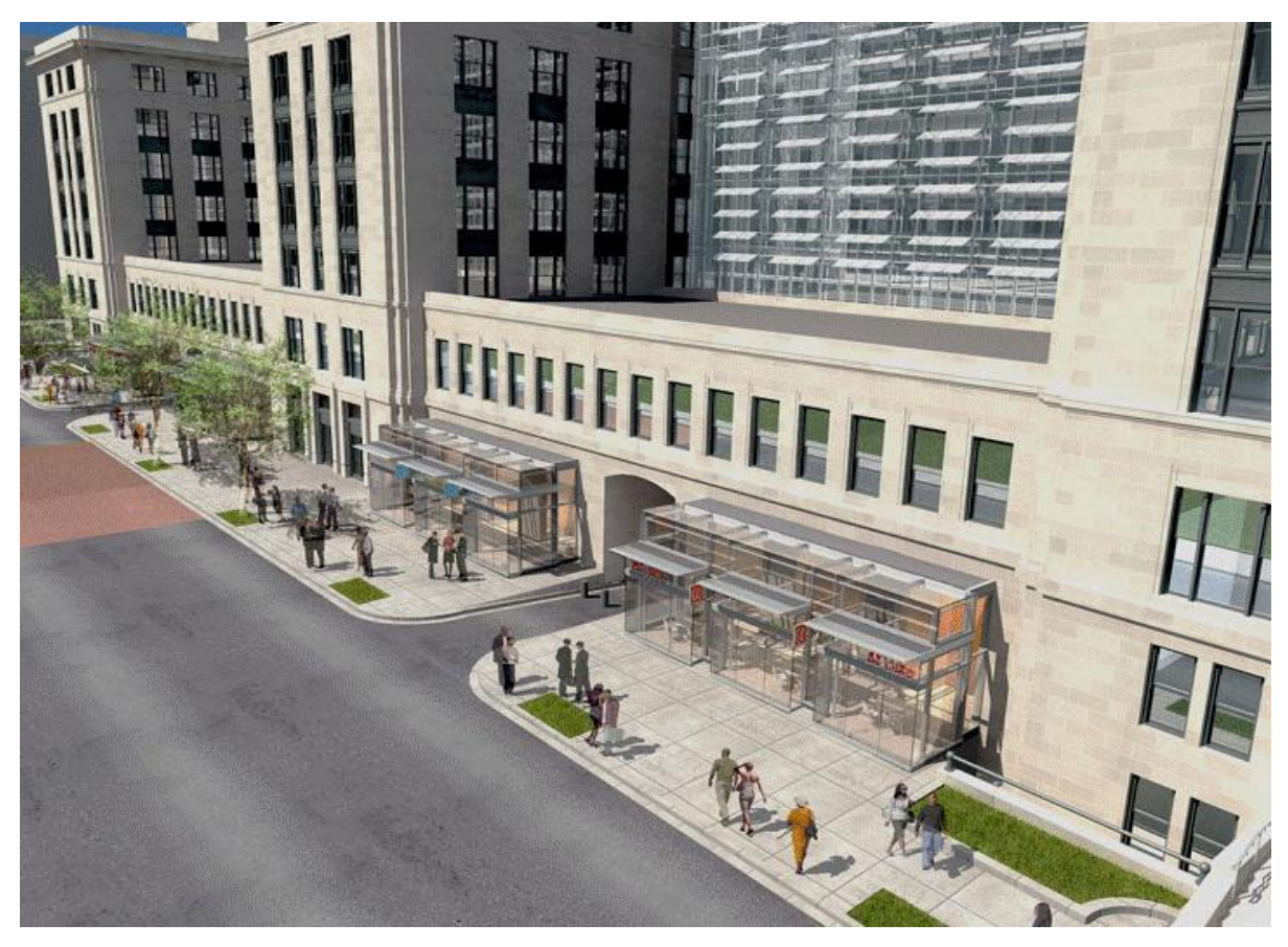
\begin{array}{l} \textbf{U.S. General Services Administration} \\ 1800 \ F \ Street, \ NW \\ Washington, \ DC \ \ 20405 \end{array}