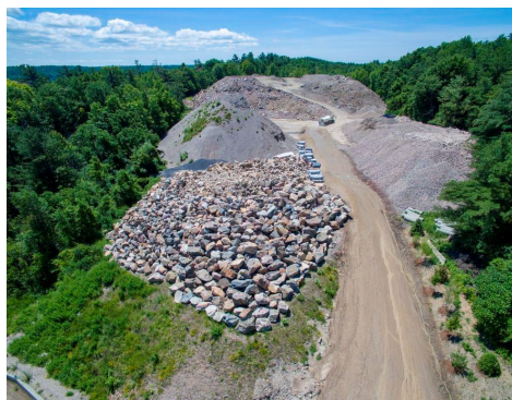
A view of the landscape rock and crushed stone storage area.

Please pay attention to all wayfinding and traffic signs, drive slowly, and be cautious around construction activity.