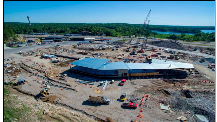
A view looking northeast of the new commercial building construction.