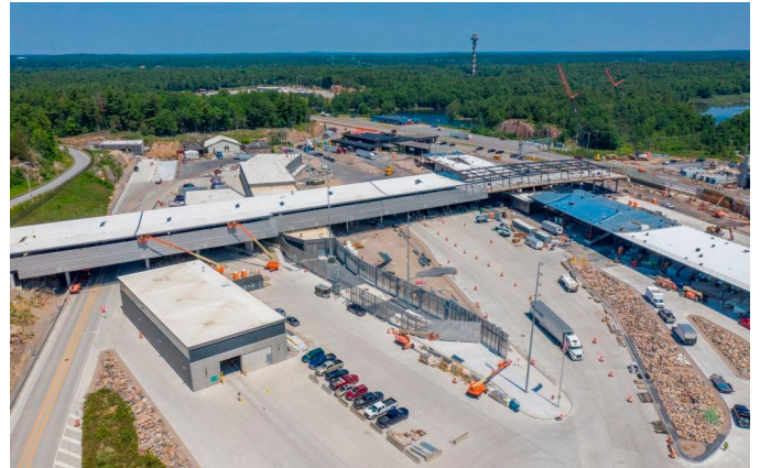
An aerial view looking northeast at the construction site.