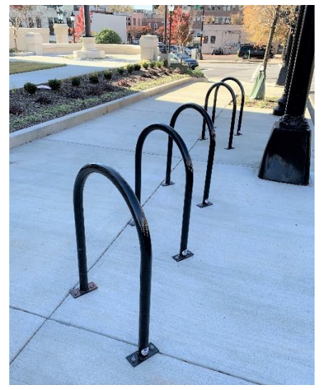
Public Bike Racks

There were many benefits of pursuing a SITES sustainable design for this project. The prominence and visibility of the project as a federal courthouse in the heart of downtown Greenville, make it an excellent tool for display of and education about sustainable design practices. Many of the sustainable features of the site are directly adjacent to public sidewalks in the heart of downtown, so the project will be highly visible and provide great opportunities to expose the employees, site visitors, and the larger public to sustainable design practices.