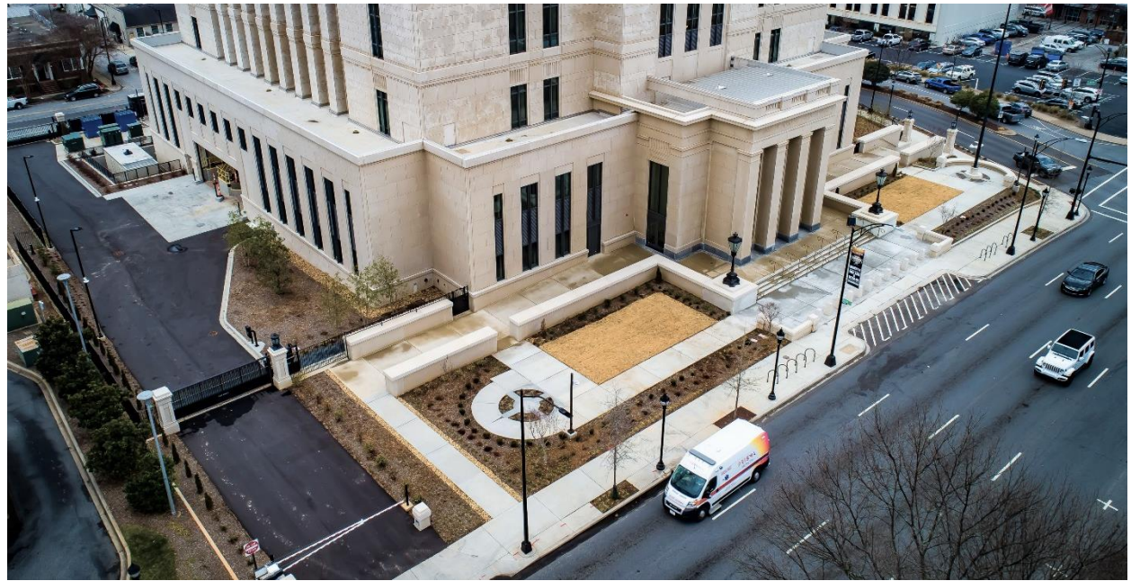
Arial View of Formal Lawn and Entry Plaza