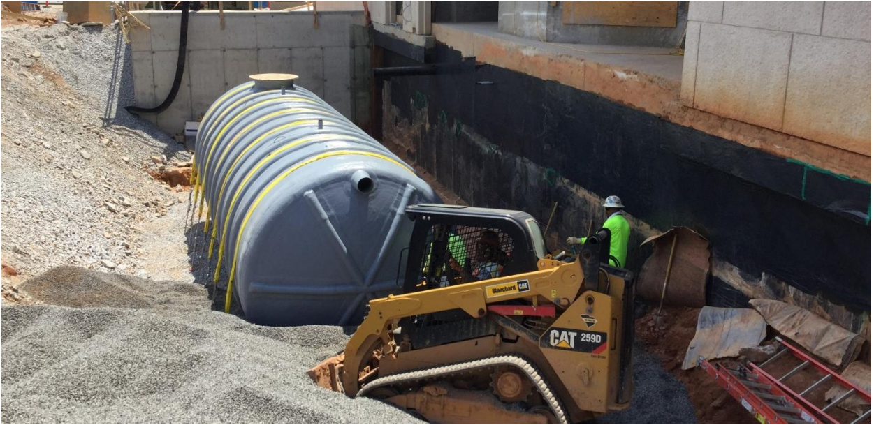
Installation Photo of the Irrigation Cistern

Landscape irrigation practices in the United States consume large quantities of potable water. This landscape design includes native and adaptive plants to reduce the need for irrigation. Condensate and rainwater are collected in an underground storage tank to reduce the need for potable water by 100%.