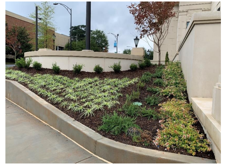
Examples of Native Plantings

Another benefit to the sustainable design is the positive impact the project has on the local environment. Sustainable stormwater management keeps the site from adding to the flooding and stormwater management challenges the City of Greenville is currently facing and provides an example of how urban projects can be designed to deal with stormwater on site in a sustainable way. The introduction of pollinator supporting species will support the vegetative health not only of the site but also of the surrounding city.