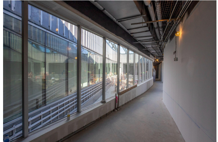
A view of the Main Building interior courtyard construction.