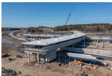
A view looking west at the end of the overhead parking deck and outbound canopy.