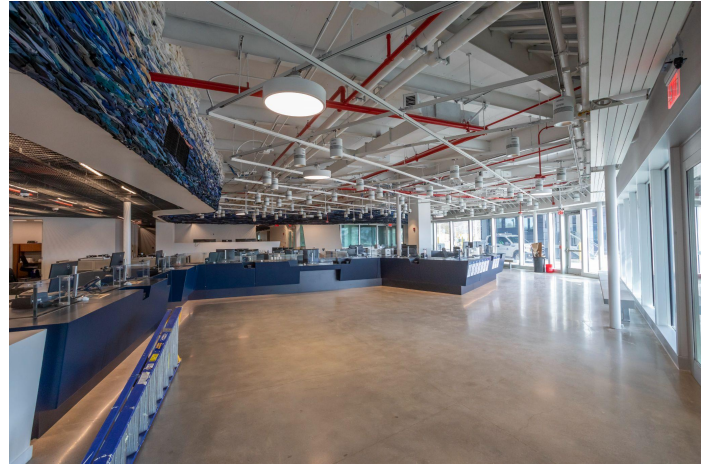
A view of the new Main Building public lobby and art installation.