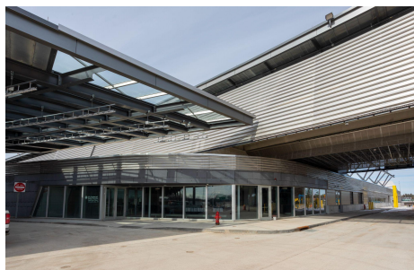
A view of the public entrance to the new Main Building.