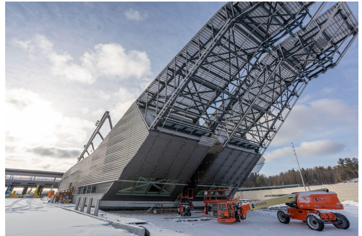
A view of the Main Building prowl.