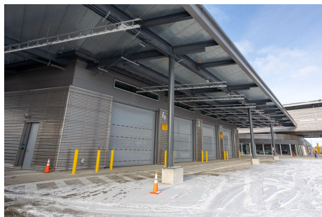
A view of the new enclosed secondary inspection building.