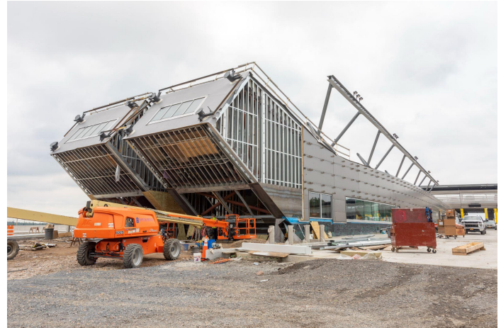
A view looking southeast of the Main Building prowl construction.