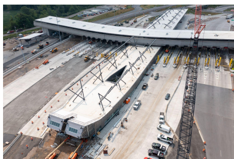
An overhead view looking south of the Main Building construction.