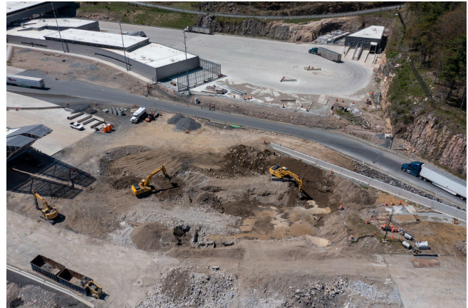
A view of the old Administration Building demolition.