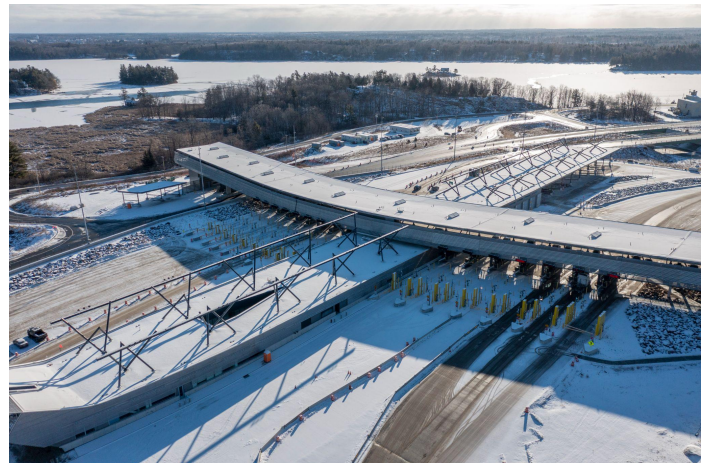
A view looking southeast at the Phase Two buildings and non-commercial inspection lanes.