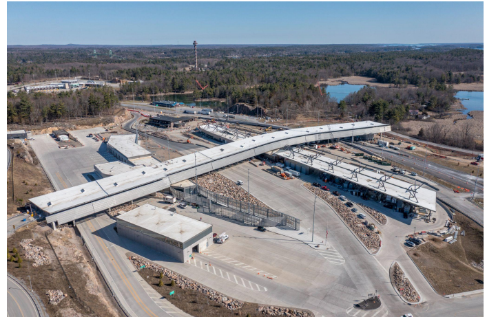
A view of the site looking northeast.