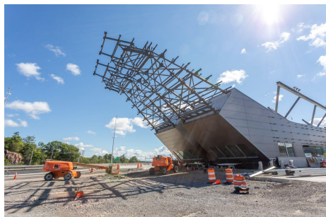
A view of the Main Building prowl steel.