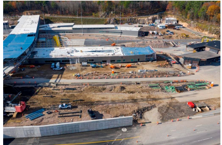
An aerial view of the pre-primary inspection area of the site