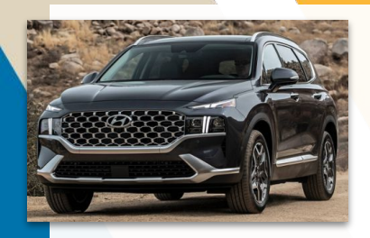
91 Santa Fe