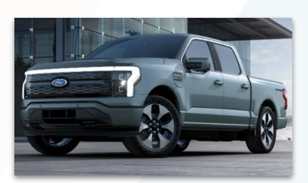
Ford F150 Lightning