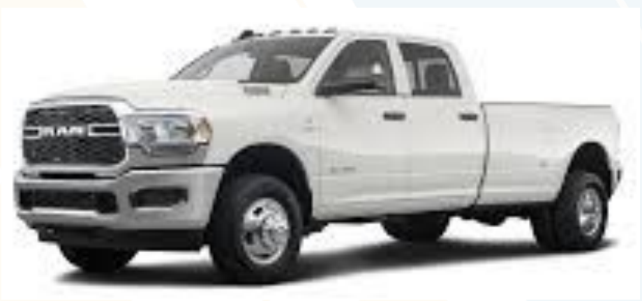
59A Ram 3500