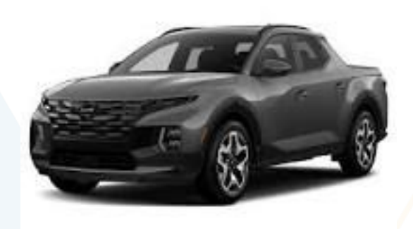
63 Santa Cruz