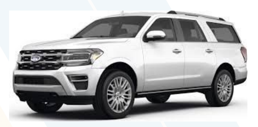
106 Expedition Max