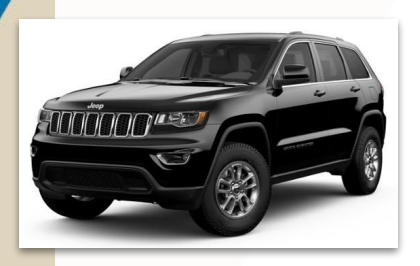
105A Grand Cherokee