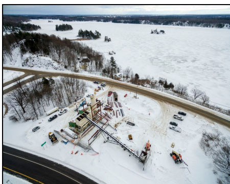
A view of the concrete batch plant erected for the project

Small blasts are expected during the winter months and precautionary building evacuations should be minimal. March 14 - 27: Hazardous materials abatement will occur on vacated warehouse building. Notice will be provided approximately 10 days prior and should not impact CBP staff, since all operations will have moved by this point.