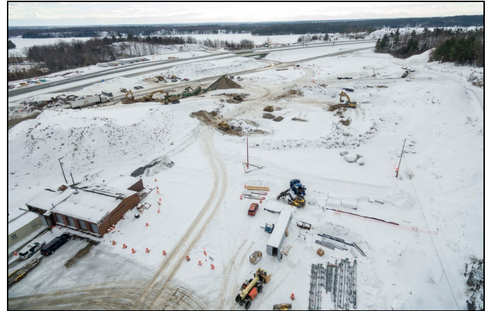
A view as seen in January 2018 from the northwest looking southeast of the future new commercial building.