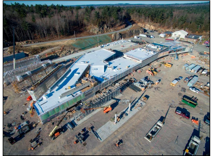
A view looking northwest at the new commercial building and overhead parking structural columns.