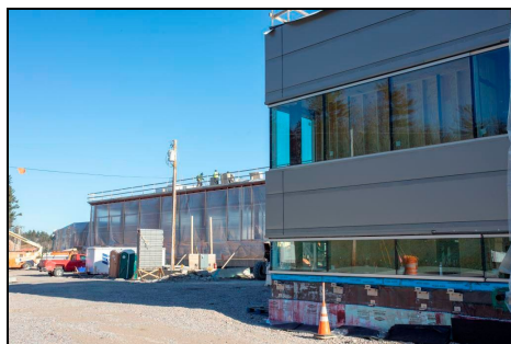
A view looking northeast at the commercial building facade.

The weather in this area can be dangerous for drivers. Please drive carefully and pay attention to construction signage and maintenance vehicles.