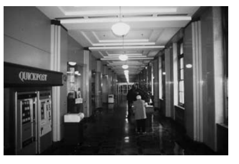
FIGURE 8 Ducts aligned with pilasters and flattened to read as shallow beams blend into historic ceilings.

Thoughtful routing, configuration and concealment of ductwork within, around, and through historically significant spaces determines the success or intrusiveness of an installation to a greater extent than any other HVAC design decision. Survey the building for available chases such as closets, dumbwaiters and abandoned chimneys available to conceal ductwork serving restoration zones. Avoid damaging ornamental ceilings and walls in courtrooms and other ceremonial spaces by routing ductwork through adjoining spaces of less significance, if necessary. Vertical routing is often the best solution for preserving vaulted ceilings where little or no space is available for routing ductwork horizontally.