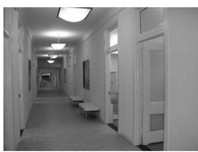
FIGURE 4 After: Relocating corridor ductwork to adjoining office spaces enabled GSA to restore previously concealed cove cornices and door transoms that now flood the corridor with welcomed daylight.

FIGURE 3 Before: GSA Building corridor ductwork installation in progress, 1935.