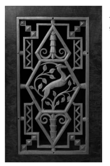
FIGURE 7 Retain and reuse historic features such as ornamental grilles.

clude a preservation architect and mechanical engineer able to demonstrate successful experience integrating HVAC into historic buildings containing significant interior spaces. Construction specifications should require historic building expertise as well. A standard preservation design scope of work and qualification requirements for design and construction are available online at www.gsa. gov/historicpreservation>Project Management Tools.