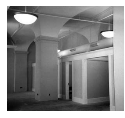
FIGURE 10 Thoughtfully exposed ductwork allows vaulted ceilings to remain exposed to view.

Installing exposed ductwork as part of thoughtfully designed open ceiling, exposed system workspace design can help to mitigate the claustrophobic effect of inherently low ceilings. Exposed duct approaches also allow occupants in historic industrial buildings adapted for modern office use to enjoy the benefits of tall ceilings, clerestory windows, skylights, monitor windows and other daylighting features designed to support the manufacturing-related functions for which these buildings were originally constructed.