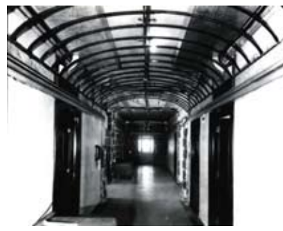
FIGURE 3 Before: GSA Building corridor ductwork installation in progress, 1935.

The first federal building to be air-conditioned was the U.S. Capitol, beginning in 1928. By the early 1930s, new offices built in the Federal Triangle were installing air conditioning systems. Air conditioning was added to GSA's Central Office Building (originally built for the Department of Interior) in 1935. Most federal buildings, however, were not retrofitted with central air conditioning systems until GSA established new facility standards in 1955, making HVAC installation standard practice for new federally funded office buildings. During the 1950s and 1960s, window air conditioning units were installed in many existing federal buildings as an interim climate control measure for improving tenant comfort. By the 1970s, advances in heating and cooling technology offered a greater range of technical choices, capabilities, and system flexibility to respond to varying needs and conditions --sometimes at the expense of reliability and manageable maintenance.