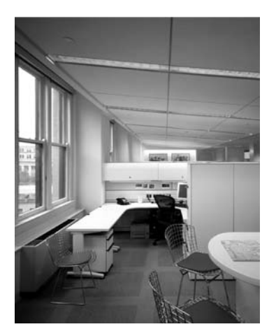
FIGURE 9 Recess, slope, or step ceilings to maintain window clearance.

Installing exposed ductwork as part of thoughtfully designed open ceiling, exposed system workspace design can help to mitigate the claustrophobic effect of inherently low ceilings. Exposed duct approaches also allow occupants in historic industrial buildings adapted for modern office use to enjoy the benefits of tall ceilings, clerestory windows, skylights, monitor windows and other daylighting features designed to support the manufacturing-related functions for which these buildings were originally constructed.