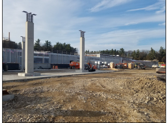
A view looking northwest at the new commercial building and overhead parking structural columns.