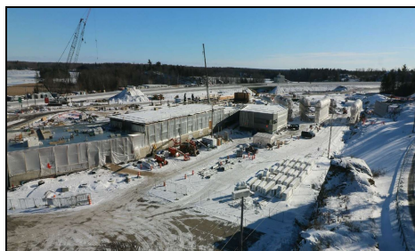
A view looking southeast at the construction site.

The weather in this area can be dangerous for drivers. Please drive carefully and pay attention to construction signage and maintenance vehicles.