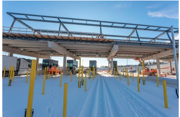
A view looking south at the commercial inspection lanes with booths installed.