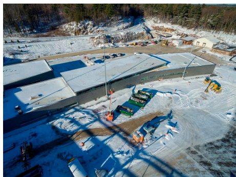
A view looking northwest at the commercial building and USDA APHIS building construction.

Snow, ice, and cold temperatures create hazardous conditions for drivers and construction staff. Please drive slowly through the port.