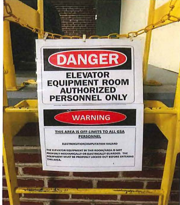
Elevator Equipment Rooms/Areas