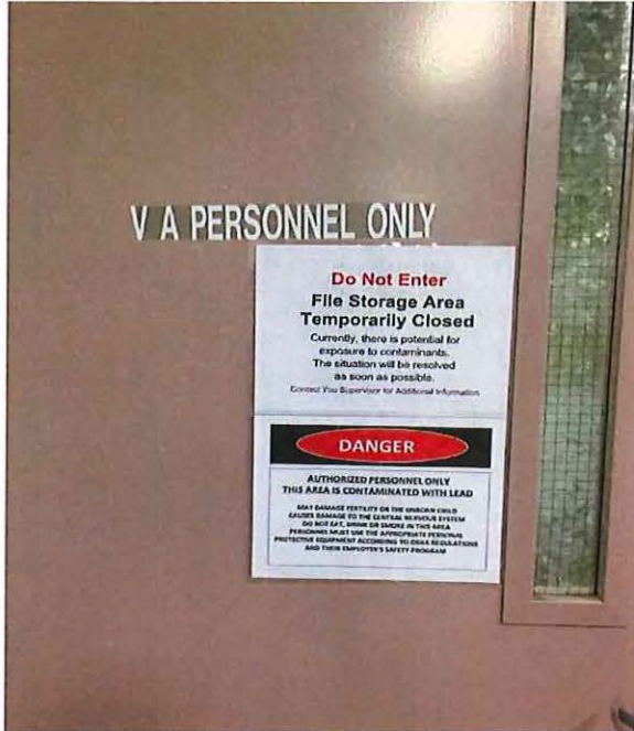
VA Records Room