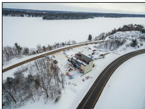
A view looking southeast at the concrete batch plant

April 2 - April 3: Hazardous materials abatement will occur on vacated warehouse building. Notice will be provided 10 days prior and should not impact port staff since all operations will have moved by this point.