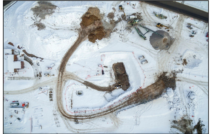
A overhead view of excavations for the new commercial building basement.