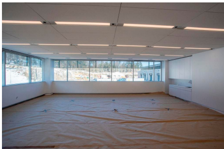
Interior view looking north within the new FDA office space.

Snow, ice, and cold temperatures create hazardous conditions for drivers and construction staff. Please drive slowly through the port.