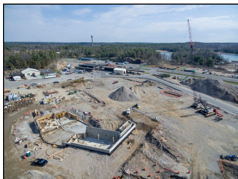
An aerial view looking northeast at the construction site.

New York State Department of Transportation is performing a re-paving project along I-81 on Wellesley Island. Please travel at safe speeds in construction zones.