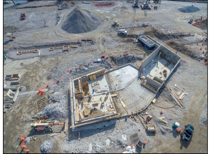
An aerial view of foundations and walls at the south end of the new commercial building.