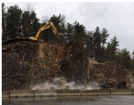
A view looking southwest at demolition of the rock outcrop adjacent to the future wastewater treatment facility.

A stop sign was added at the intersection of the I-81 southbound on ramp and CR-191. Please drive slowly in this area as construction activities are ongoing.