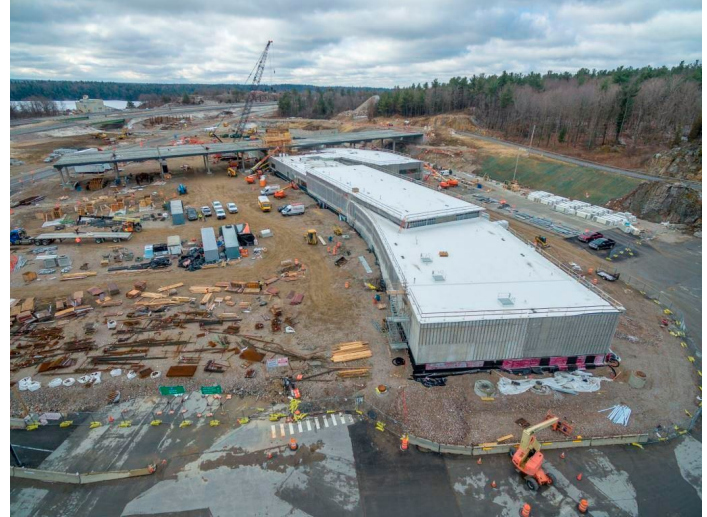
An aerial view looking south at the commercial building construction.