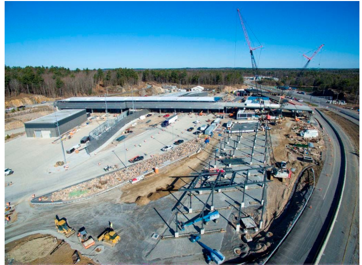
An aerial view looking north at construction of the secondary inspection canopy and new Main Building.