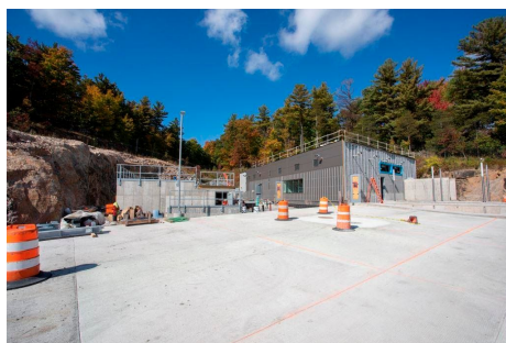
A view of the construction of the new USDA Building and treatment plant.