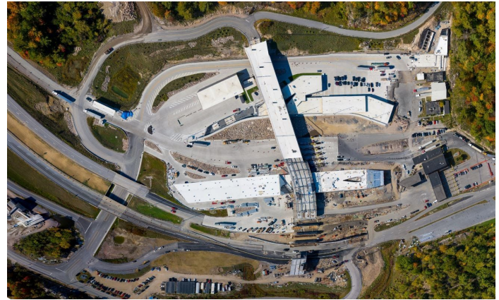
An aerial view of the project site.