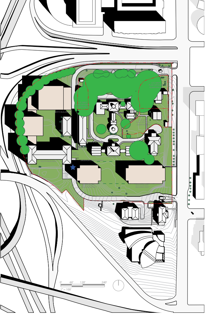
Site Plan - Development Alternative A