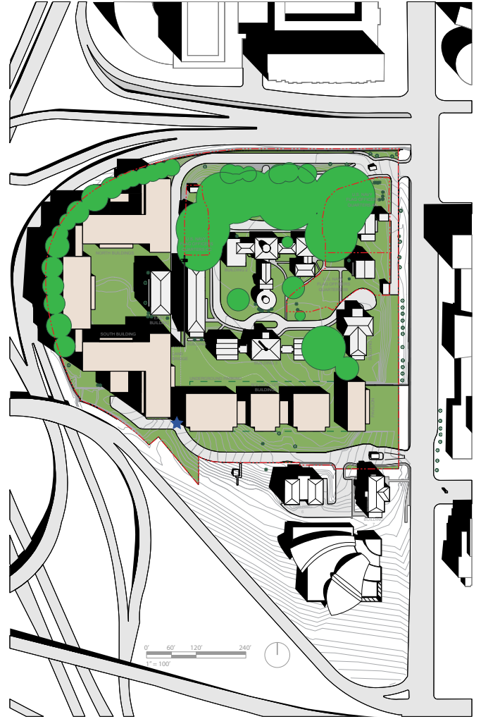
Site Plan - Development Alternative C