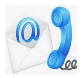
Contact us for help