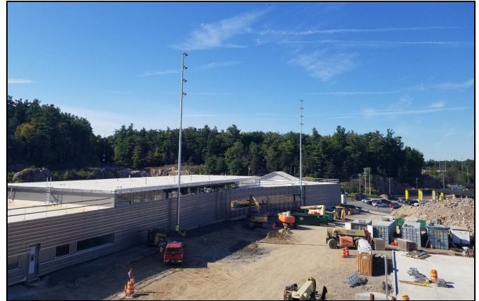
A view looking north from the overhead parking structure toward the construction of the commercial building exterior facade.