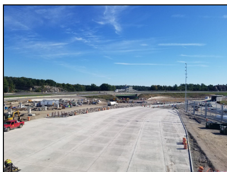
A view looking south from the overhead parking structure toward the construction of roadways leading to I-81 southbound.

Please pay attention to all wayfinding and traffic signs, drive slowly, and be cautious around construction activity.