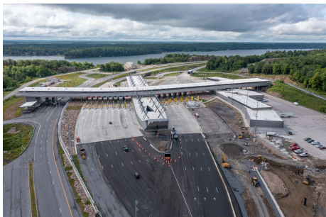
A view looking south at the nearly complete LPOE.