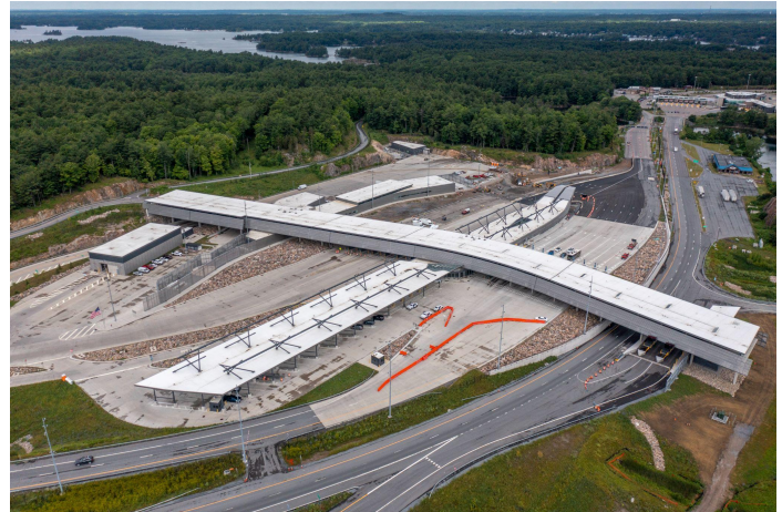
A view looking north at the nearly complete LPOE.