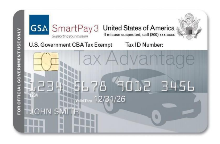
TAX ADVANTAGE TRAVEL CARD

The following guidance is to be used with regards to SP3 travel cards. It explains the Bank Identification Numbers (BIN) and how to identify authorized and non-authorized users of the City Pair Program (CPP) for IBAs and CBAs. This information will assist with the filing of fares and form of payment for the FY21 City Pair Program awards and beyond.