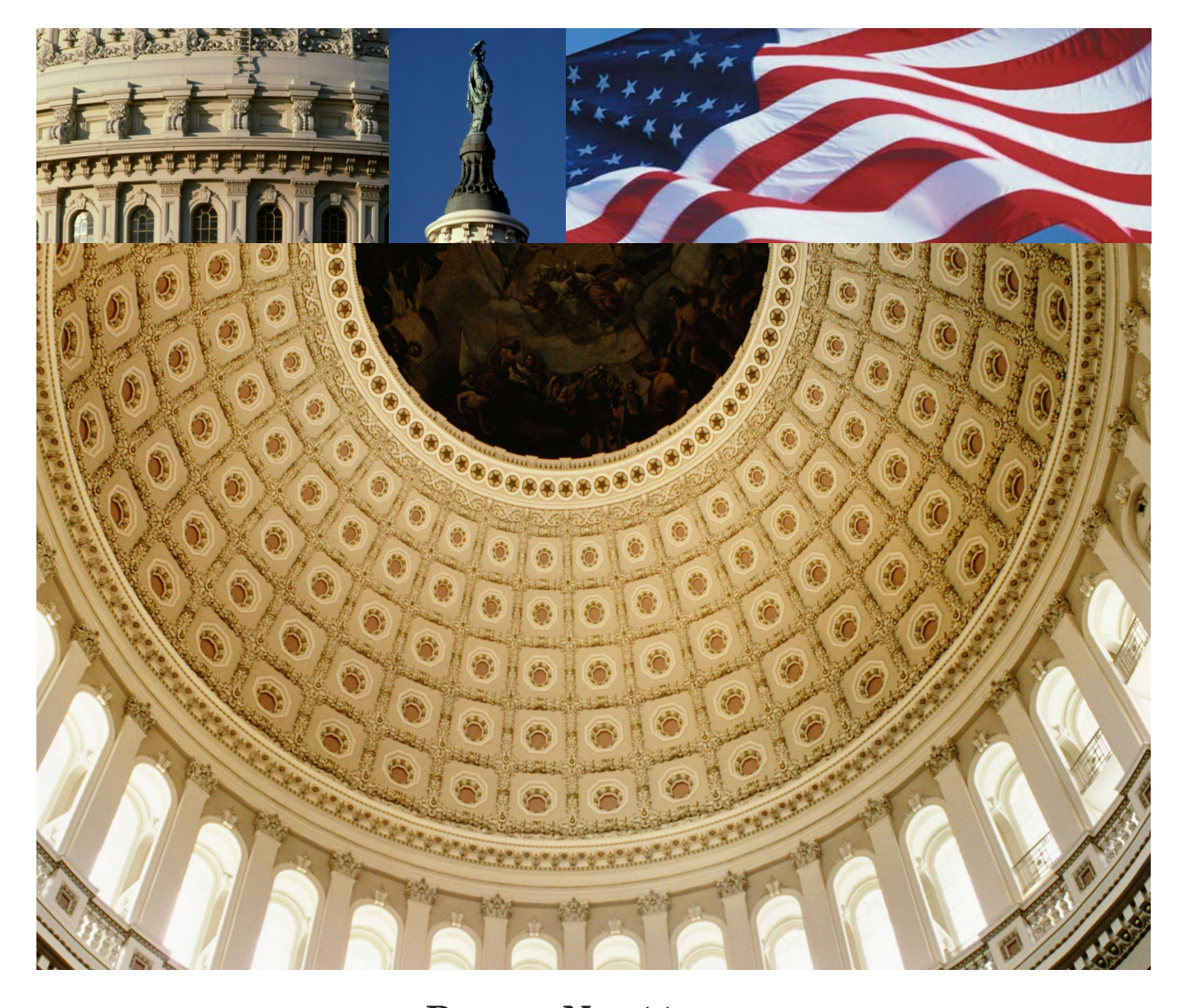
Report No. 44 October 1, 2010 to March 31, 2011